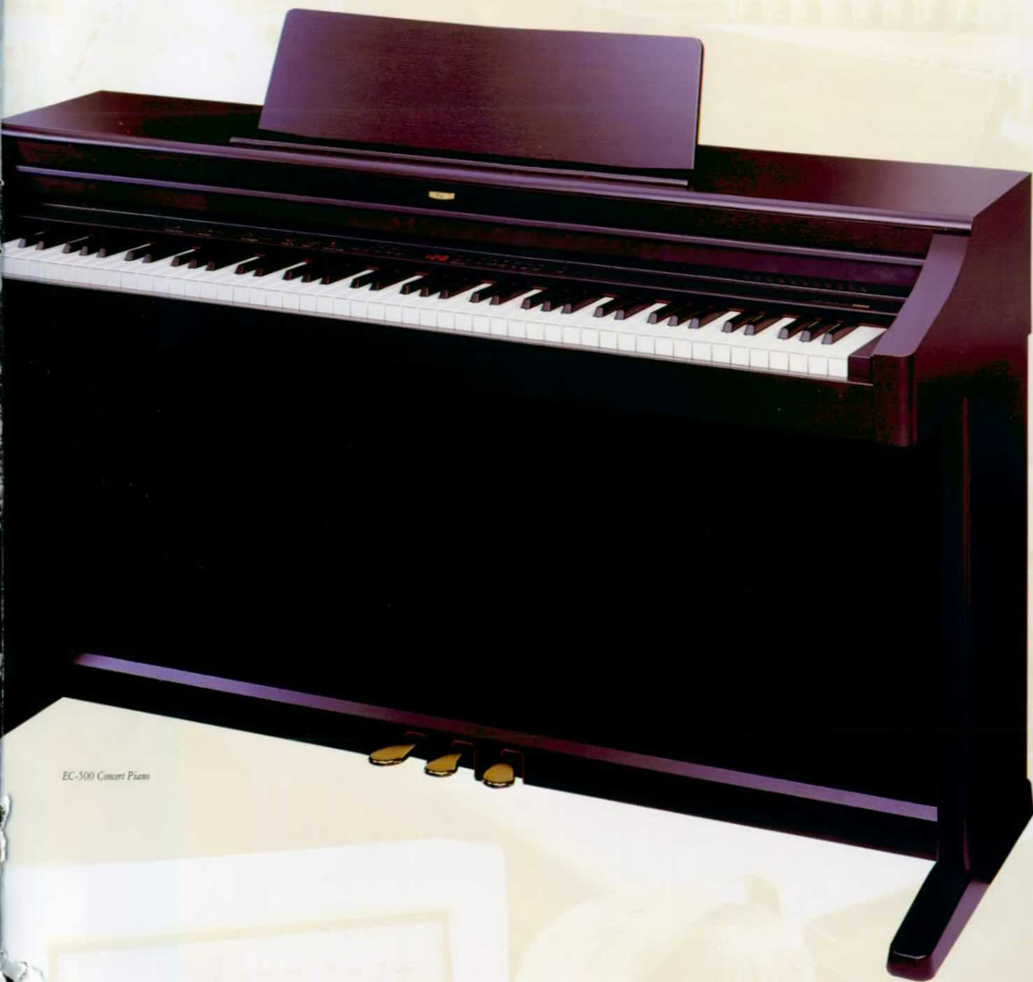
EC-500 Concert Piano

Naturally you will want to add your own effects to the music you create and record. Increase or diminish reverberation at the touch of a button and you can sound as if you are playing in a concert hall or small room. Transpose the pitch to match other instruments. Or select a different temperament – perhaps to play classical music exactly as it was originally composed. The EC range has the specification to be able to respond to your every creative wish.