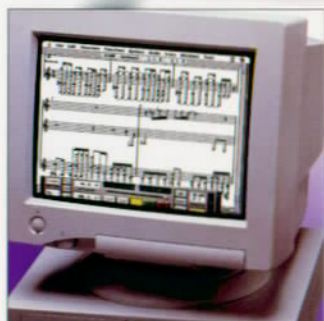
Connect to a PC host

Classically-trained pianists will feel right at home on the EC-500 due to completely authentic sound (sampled using the latest technology) and weighted feel, whilst those developing their musical skills will develop the best technique.