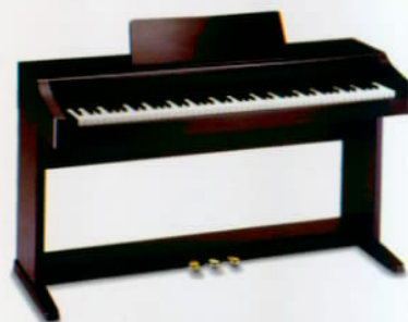
EC-300 Concert Piano