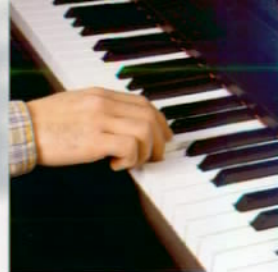
Precise key weighting