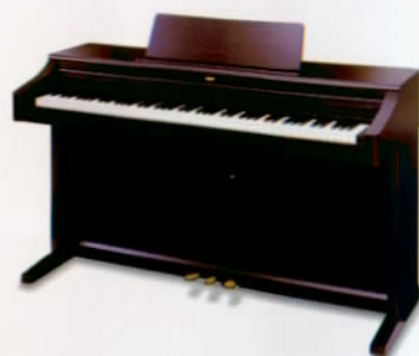
EC-500 Concert Piano