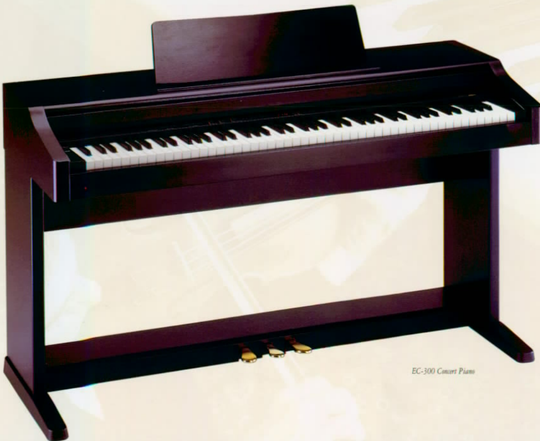
EC-300 Concert Piano

These instruments not only sound like traditional pianos – they feel like traditional pianos, thanks to the precise weighting of the keys and the fidelity of digital sound technology. And with features including real rosewood, a compact design, and an attractive lustre finish, they will also enhance the appearance of any room or venue.