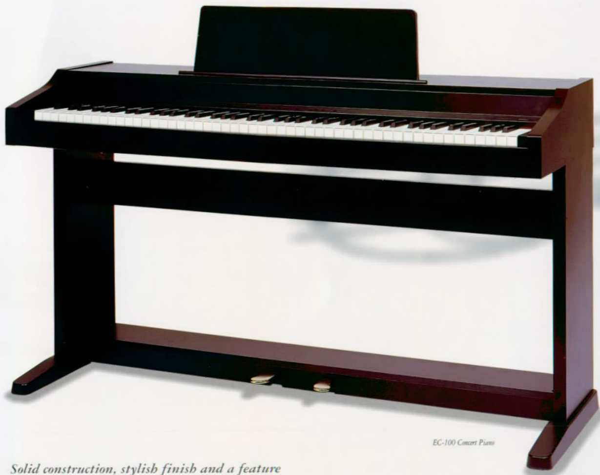
EC-100 Concert Piano

Solid construction, stylish finish and a feature list honed to the essentials makes the EC-100 the most affordable of concert piano range.