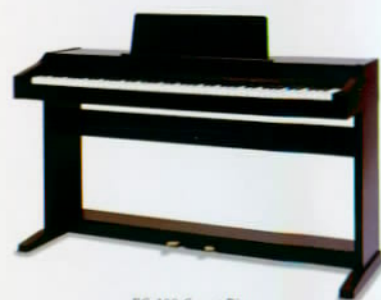
EC-100 Concert Piano